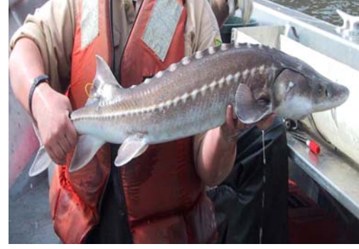
White sturgeon (up to 240" long)

Acknowledgements: This project was funded with a grant from Oregon Parks Foundation and support from City of Portland Bureau of Environmental Services.