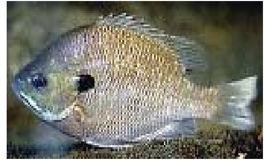
Bluegill (up to 16" long)