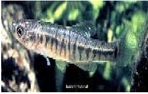
Banded killifish (up to 4" long)