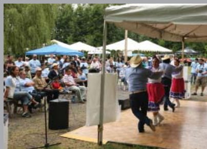
Explorando attendees enjoyed live dancing, canoe rides, activities and a free t-shirt.