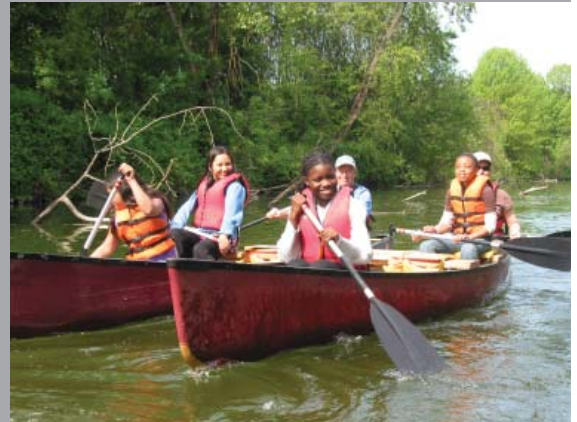
Local students enjoy a canoeing field trip with Slough School. All Slough School classroom visits and field trips are offered free to schools in the watershed.

Slough School partnered with Willamette Riverkeeper on additional canoe trips for 22 local high school students