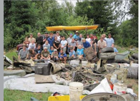
30 volunteers at the Great Slough Clean Up hauled old TVs, tires, buckets, and scrap metal from Whitaker Slough.