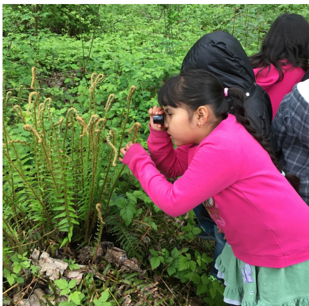
Rigler 2nd grade studies Habitats at Kelley Point Park

Slough School serves K-college students with free field, classroom, and canoe programs about the natural and cultural history of the Columbia Slough Watershed.