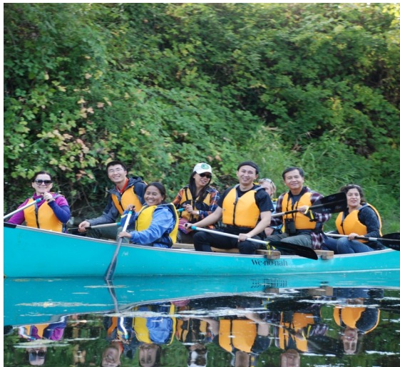
Evening Canoers paddle off into the sunset