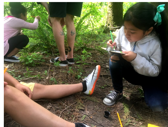
Woodland 3rd graders illustrate plants behind their school in Fairview Creek's riparian zone