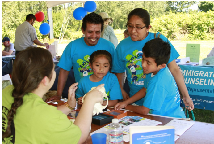
Explorando festival participants at registration