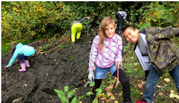
Sitton 5th grade at the Slough's mouth at Kelley Point Park

Slough School: Authentic learning from the Columbia Slough and its Watershed