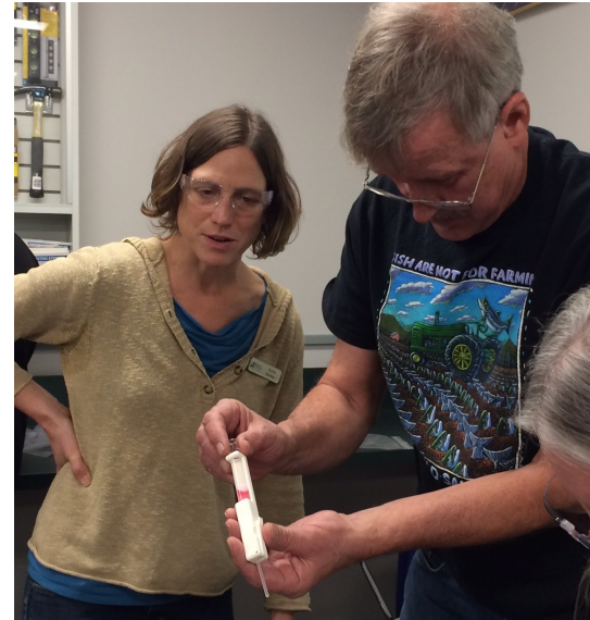
Learning about our aquifer at Groundwater 101