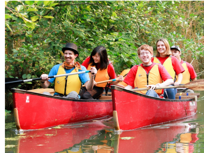
Aquifer Adventure participants go for a bimiran ride