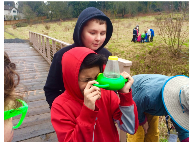
Fairview 5th graders restore Wilkes Creek Headwaters and investigate what lives in the water