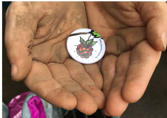
5th grader post planting at Salish Ponds