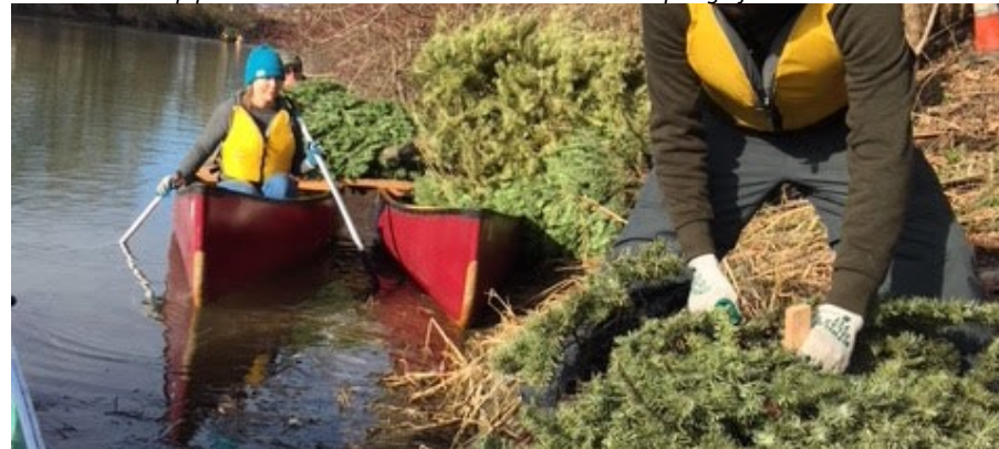
Volunteers toss recycled Christmas trees into engineered log jams in the lower Slough