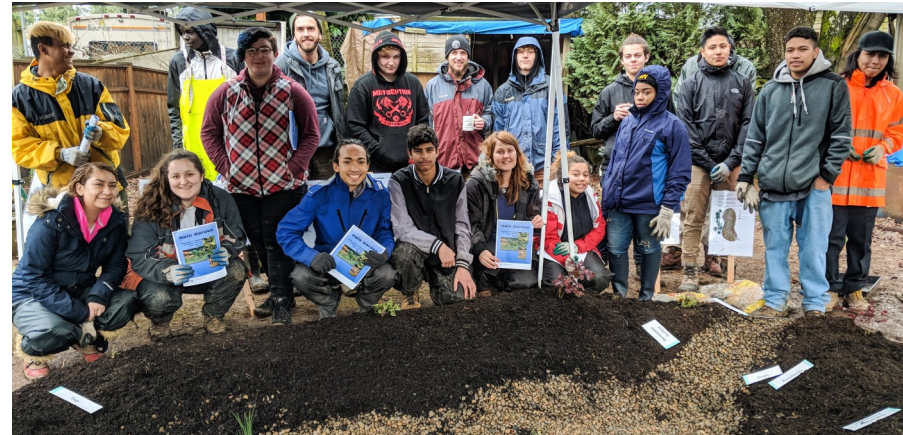
Verde, CSWC, MYC and Habitat 4 Humanity partner to build rain gardens in Cully