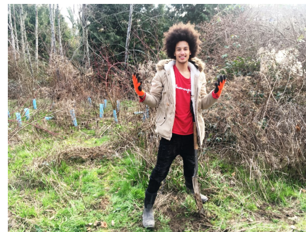
Alliance at Meek HS students restore East Whitaker Pond