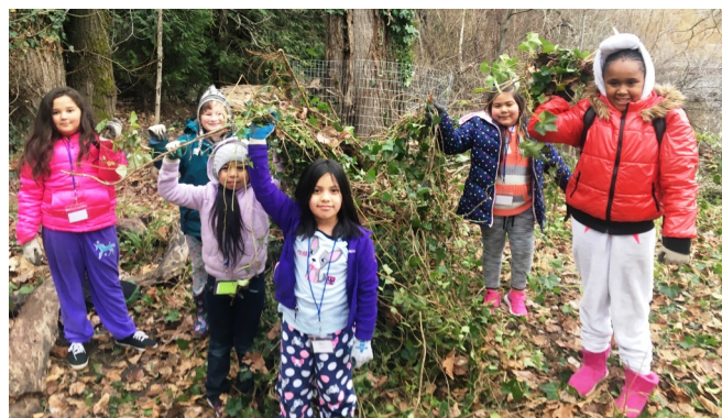
King 3rd/4th explores the community at Whitaker Ponds and removes huge piles of English Ivy