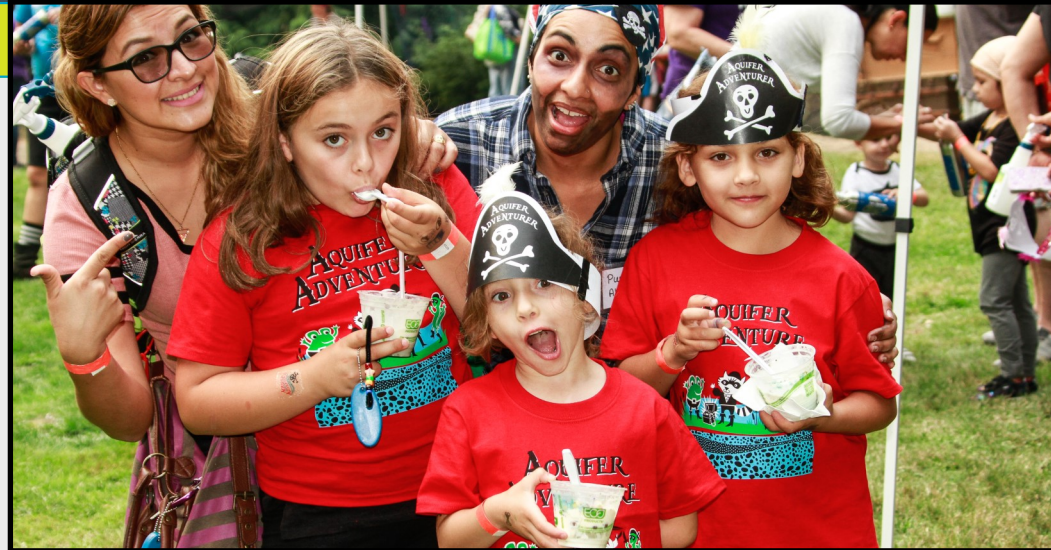
Aquifer Adventure participants enjoy their edible aquifer model