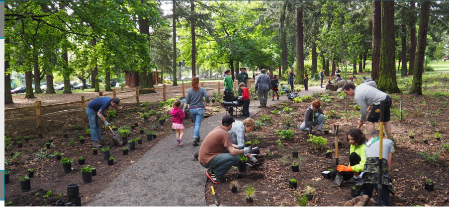
Volunteers help plant the Alberta Park Nature Patch in the spring of 2018