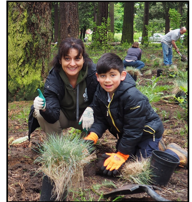
Stewardship Saturday volunteers planting at Alberta Park