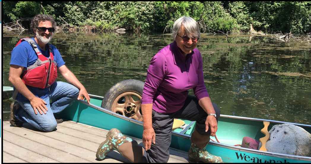
Paddle Team volunteers remove trash from Whitaker Slough

... If you ever have a chance to work with this team, I highly recommend it!"