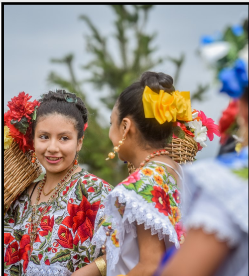
Dancers at the Cully Park Grand Opening, June 2018