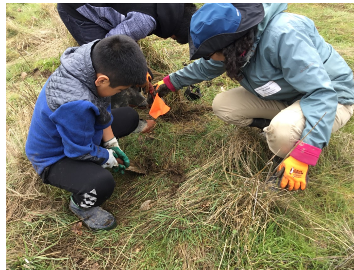
All Woodland 3rd, 4th, and 5th graders worked with CSWC and Wisdom of the Elders to create 3 new habitats on their