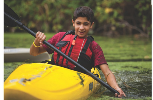
Students and families from the Iraqi Society of Oregon participated in all three of our programs throughout the year thanks to a CSWP grant from the City of Portland, Bureau of Environmental Services.

A new education steering committee was formed.