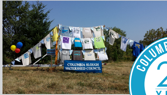
Celebrating 20 years of the Columbia Slough Regatta and work in the watershed