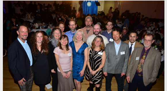
One Leadership Award and two Achievement Awards were presented at Slough Celebration for outstanding work in improving watershed health.

Stewardship worked at 8 primary sites in the Columbia Slough watershed: Conifer Park - Fairview Creek, Force Lake, Whitaker Ponds Nature Park, Wilkes City Park, Wilkes Headwaters Natural Area, Peninsula Crossing Trail, Johnson Lake and Columbia Children's Arboretum.