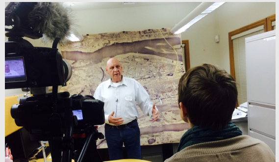
The Council honored our 20th year with a community story sharing and documentation event: Slough Stories